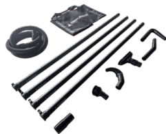
P14900 VERTIVAC – CONDUCTIVE ACCESSORY KIT FOR CLEANING AT HEIGHT Ø 40MM An ultra-lightweight, conductive carbon fiber extension system designed to safely reach hard-to-reach spots and elevated structures from the ...