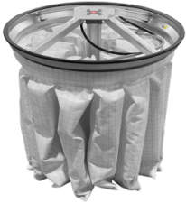
PSC Semiautomatic pneumatic filter shaker