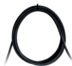
POWER SUPPLY CABLE