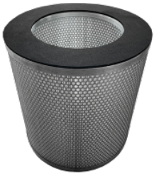
HEPA 13 Absolute filter (EN 1822) 110.000 cm 2 filter surface H14 Class Filter (EN 1822) Glass fiber