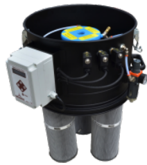
SP Automatic reverse jet cleaning system Antistatic M class filter (EN 60335-2-69), 3 Polyester filter cartridges, 9 m 2 filter surface