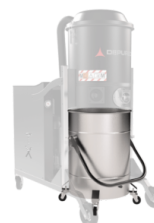
BX Stainless steel bin AISI 304