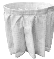
ANT M Antistatic filter (M class EN 60335-2-69)