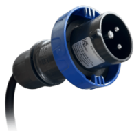
PLUG 3-pin industrial plug