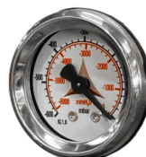
VACUUM GAUGE Vacuum gauge for indication of filter clogged or in need of replacement