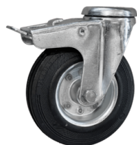
WHEEL WITH BRAKE Non-marking wheel with integrated brake