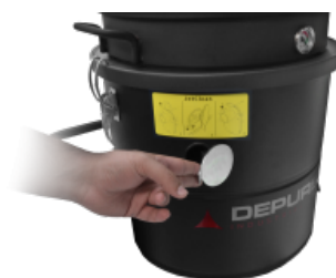
JC Jet Clean