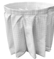
ANT M Antistatic filter (M class EN 60335-2-69)