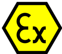
THIRD PARTY ATEX CERTIFICATION