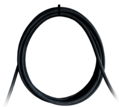
POWER SUPPLY CABLE