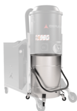
BX Stainless steel bin AISI 304