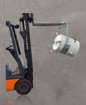
BIN EMPTYING KIT