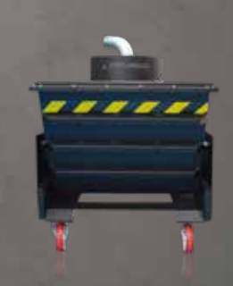
TILTABLE 580 LT