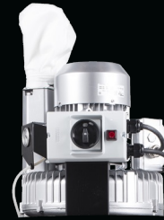
7,5 kW Side channel blower