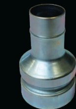
Iron reducer ø 100/100 mm