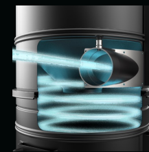
Tangential Inlet with cyclone