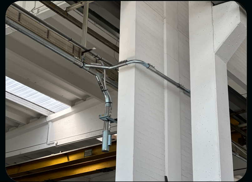
Built-in pipes cleaning system