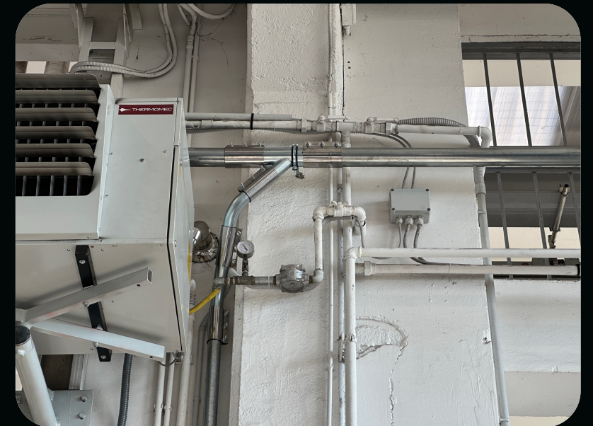
More than 300 meters of piping