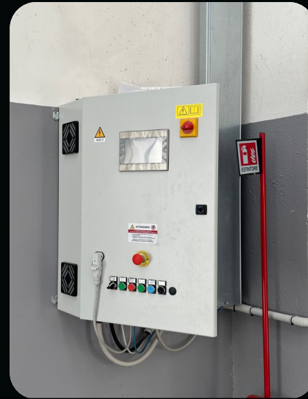
4.0 control panel with inverter