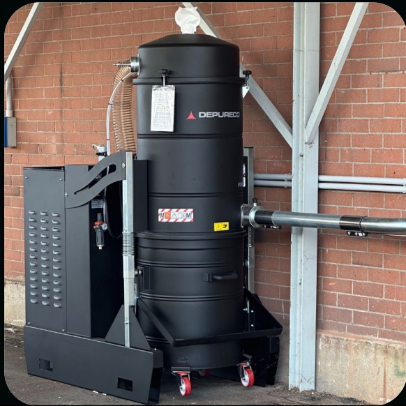
PUMA FIX 10 – vacuum unit