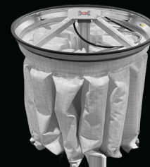
Automatic cleaning system PSC