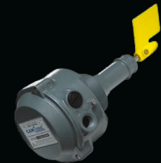
Rotary level sensory