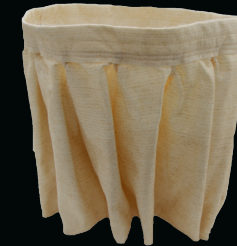
Nomex filter (up to 250°)