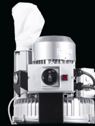
11 kW Side channel blower