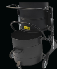
175 liters collection bin